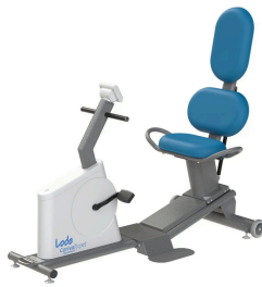
Corival recumbent cpet