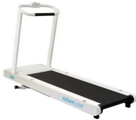
Valiant 2 cpet Valiant 2 cpet XL