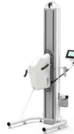
Angio automatic stand