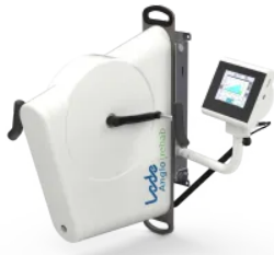
Angio static wall fixation