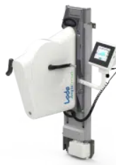
Angio electrical adjustable wall fixation