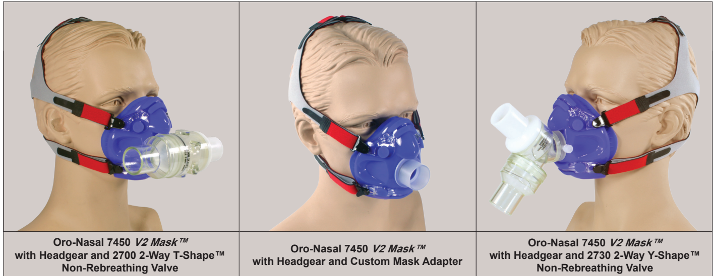
Oro-Nasal 7450 V2 Mask™ with Headgear and 2700 2-Way T-Shape™ Non-Rebreathing Valve

Large, Medium, Small, Extra Small, Petite