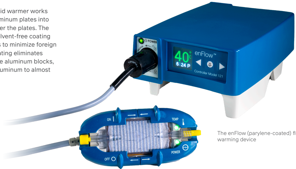
The enFlow (parylene-coated) fluid warming device

The enFlow® (parylene coated) fluid warmer works by direct transfer of heat from aluminum plates into the infusate as the fluid passes over the plates. The plates are coated in parylene, a solvent-free coating often used on implantable devices to minimize foreign body reactions or elution. This coating eliminates direct contact of the fluids with the aluminum blocks, dramatically reducing elution of aluminum to almost undetectable levels.